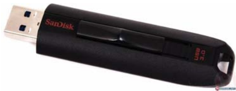
SanDisk Extreme 64GB $69.99