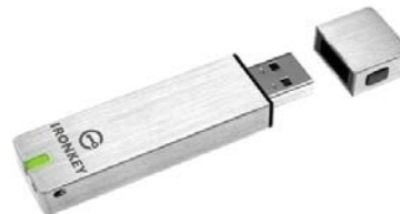
IronKey Personal $109-$599